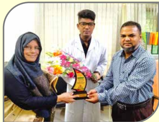
Getting Honours Mark in Microbiology 3rd Professional Exam of May 2020 (Held in January 2021)