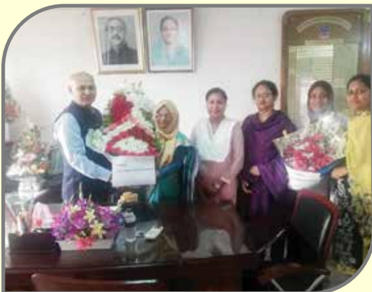
Basic sciences faculty deen of DU receives bouquet from our Principal